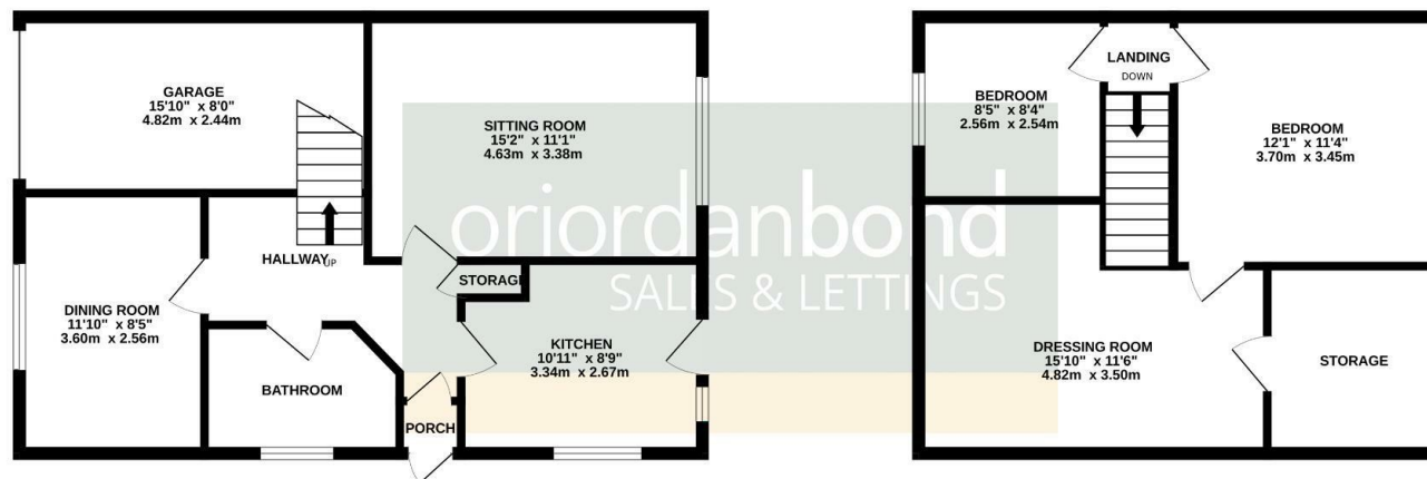
1ST FLOOR 470 sq.ft. (43.7 sq.m.) approx.

TOTAL FLOOR AREA : 1085 sq.ft. (100.8 sq.m.) approx.